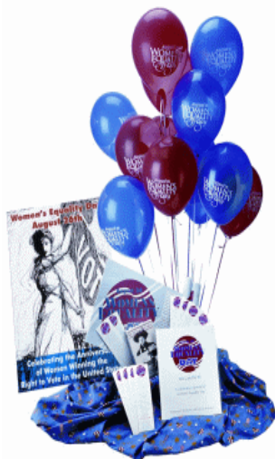
Women's Equality Day August 26

With the September meeting we will be resuming our door prizes. At each meeting, two brand new books by female authors will be awarded as door prizes, with winners drawn from attendees.