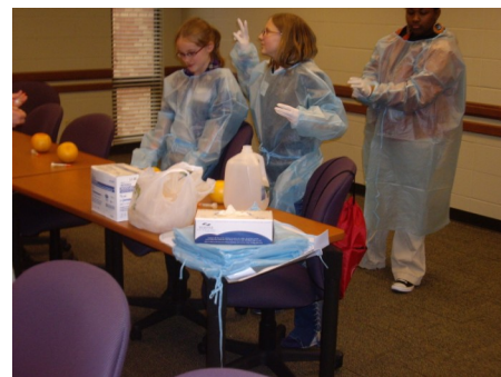
Expanding Your Horizons Career Conference for Girls last February