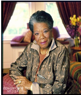
Dr. Maya Angelou

Dr. Maya Angelou will speak at Margo Jones Performance Hall on the TWU campus Wednesday, February 22, at 11:00 am. Dr. Angelou will read excerpts from her past works and share her wisdom and insights.