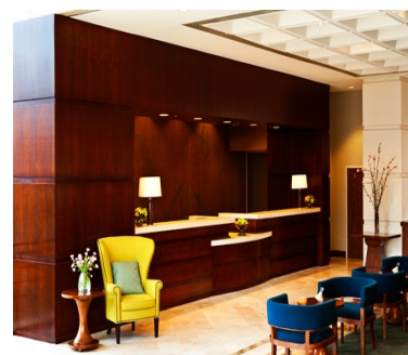
Sheraton Austin Hotel at the Capitol