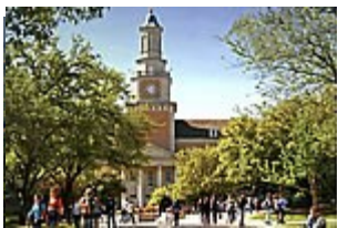
University of North Texas