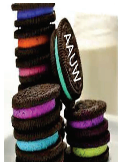
The Best Stuff IS in the Middle AAUW-Texas State Convention Hurst, TX—April 25-27

AAUW-Texas is still trying to secure $200,000 for the Ann Richards AAUW American Fellowship. Please remember the fellowship as you donate to the AAUW Educational Fund.